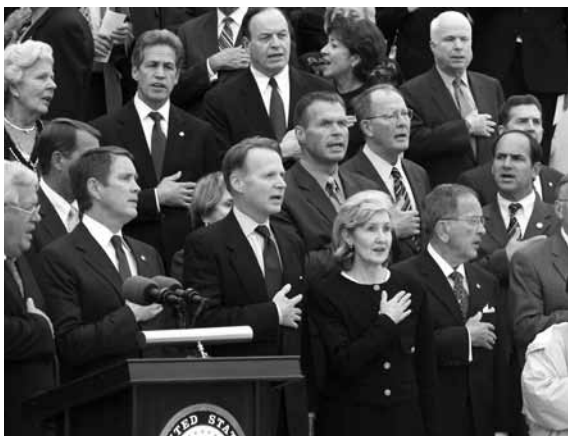
9/11/06: Congress sings "God Bless America" each year on the anniversary of the attacks.