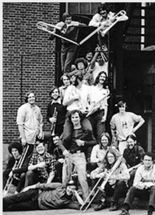
Harvard Jazz Band from 1972.

ALL EVENTS ARE FREE AND TAKE PLACE IN JOHN KNOWLES PAINE CONCERT HALL AT 8:00 P.M. UNLESS OTHERWISE NOTED. Free passes are required for the Chiara Quartet concerts only, available two weeks before each concert at the Harvard Box Office, Holyoke Center. For information: musicdpt@fas.harvard.edu or http://www.music.fas.harvard.edu/ Please check ahead for availability of free parking at Everett Street Garage.