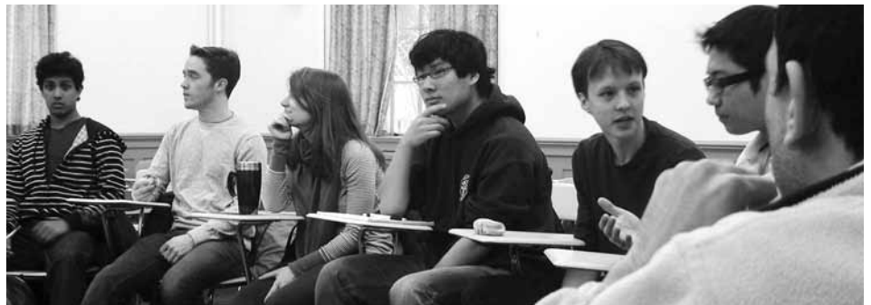
Student composers each received Apogee G-1 for Mac from to boost their recording and audio processing ability.

“For me,” Einziger says, “I create a scaffold and use it to write music on top of. You can take stuff away later. I think it’s a way of writing music that’s caused by the ability we have to create music in programs like Garage Band. But you have to want to try things differently and it’s a scary thing to do. Be brave!”