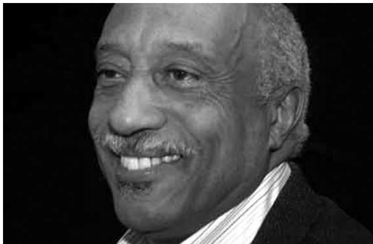
Vibraphonist Mulatu Astatke performs with the Either/Orchestra

No tickets are required. Free parking is available after 7:00 pm on