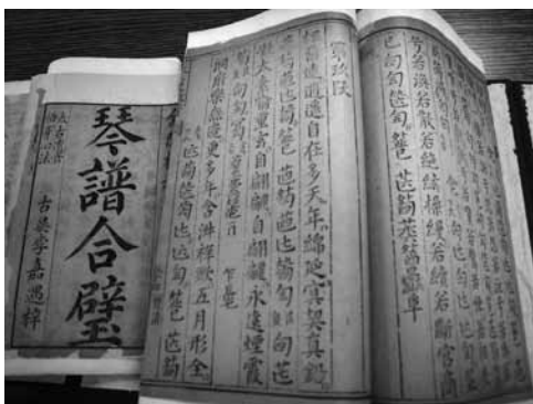
Qin Pu he bi , which includes a score in Chinese Jianzipu notation