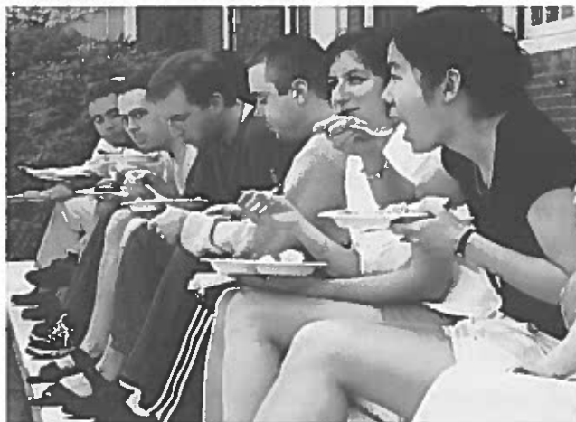
Graduate students on the steps of Paine Hall during the annual department picnic.