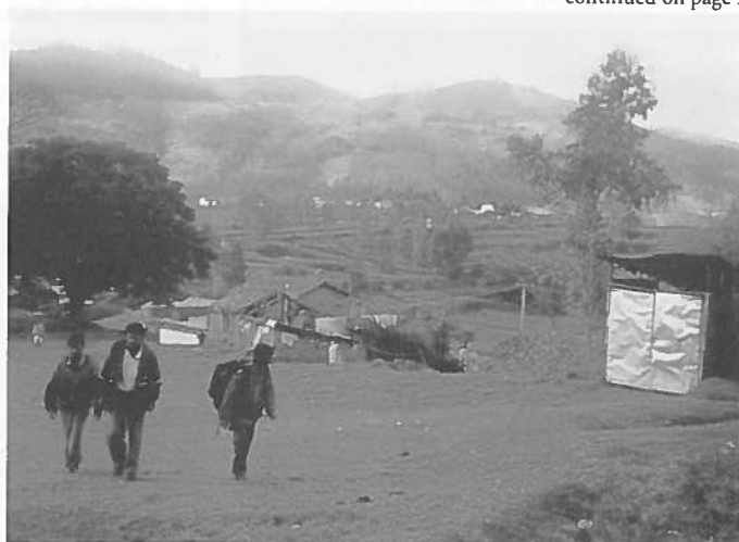
The Nilgiri Hills, South India