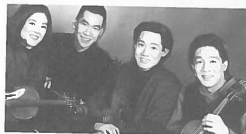
Three brothers and their sister make up the Ying Quartet.

From the world's most prestigious stages to the rural farm towns of America, the Ying Quartet has earned recognition for both its brilliant concert performances and its enterprising promotion of chamber music's larger role in society. Winners of the 1993 Naumburg Chamber Music Award, Quartet-in-Residence at the Eastman School of Music since 1996, and creators of LifeMusic, we are pleased to have the Yings join the Music Department as Blodgett Artists-in-